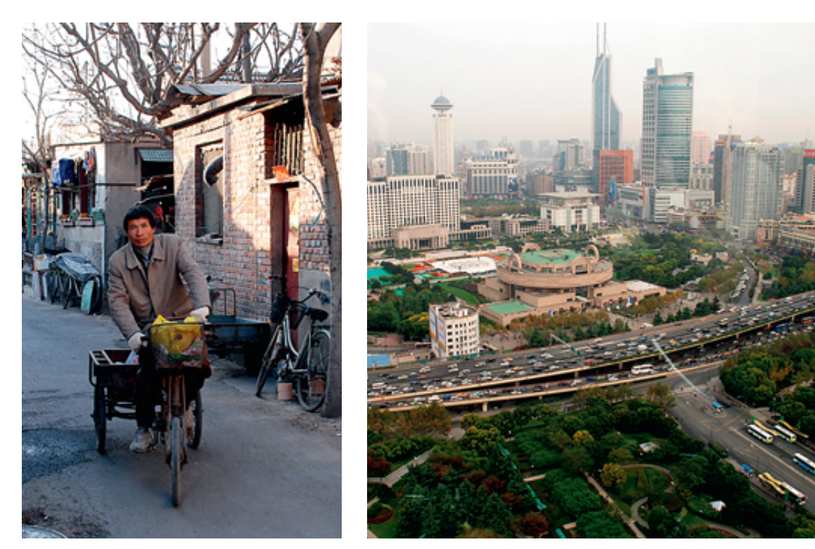
China, a fast-growing country with clear contrasts - even within the same city.

more talk of influence via dialogue, repeated visits and a focus on improvements rather than zero tolerance for failings. It is quite clear that Western companies have a positive impact on Chinese companies and are able to exert influence.